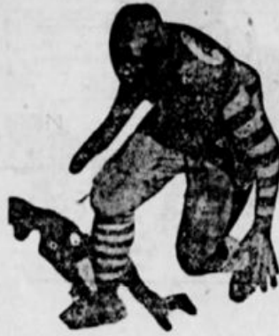
FRED "DUKE" SLATER. Tackle.

"Tillie" Voss is considered one of the best end men in the country.