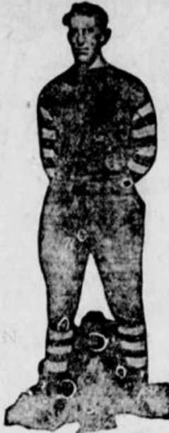
"TILLIE" VOSS. End.

ROCK ISLAND, ILL.—Every man on the Rock Island football team is a pigskin warrior of no little class but there are a trio of pigskin chasers who stand out very prominently.