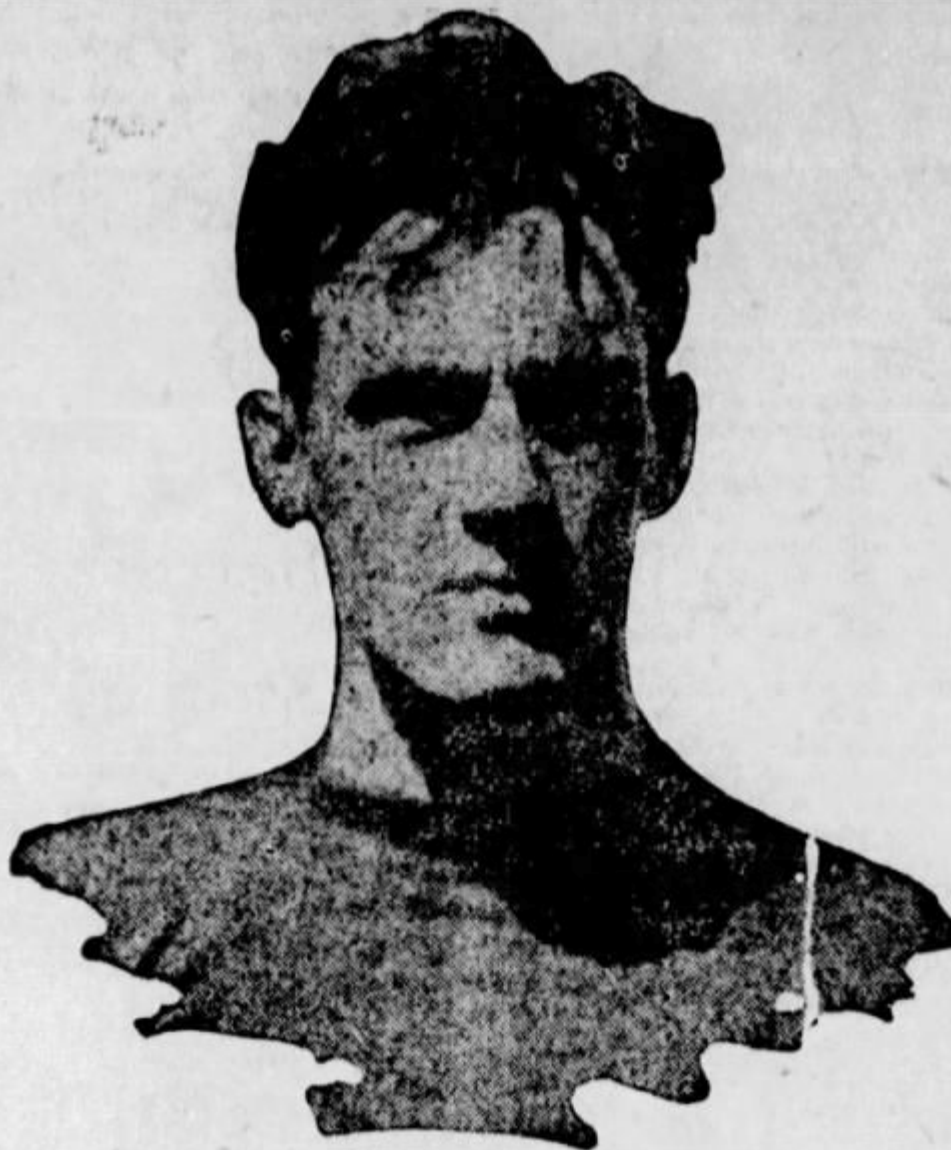
JIMMY CONZELMAN. Quarterback.

Jimmy is 24 years old. He played two years at Washington university St. Louis and was All Missouri quarterback. He was a member of the famous Great Lakes of 1918-19. He joined the Decatur Staleys in 1920 and made the touchdown which beat Rock Island in first game.