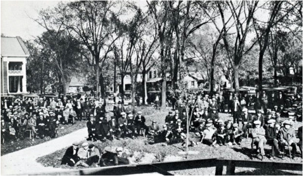
Fans here are gathered at Legion Park in Green Bay to watch the "Playograph" which relayed Packer plays during away games in 1924, before the advent of radio. Telegraph reports from the game's press box were used to re-create the game on a mechanical display board.