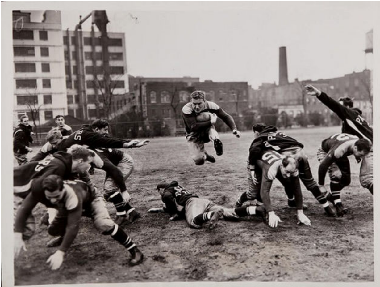
Clarke Hinkle, coming through an opening, as the Packers prepared for their 1937 meeting at the Polo Grounds versus the Giants.