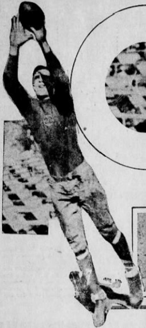
Lavvie Dilweg, End (Marquette)