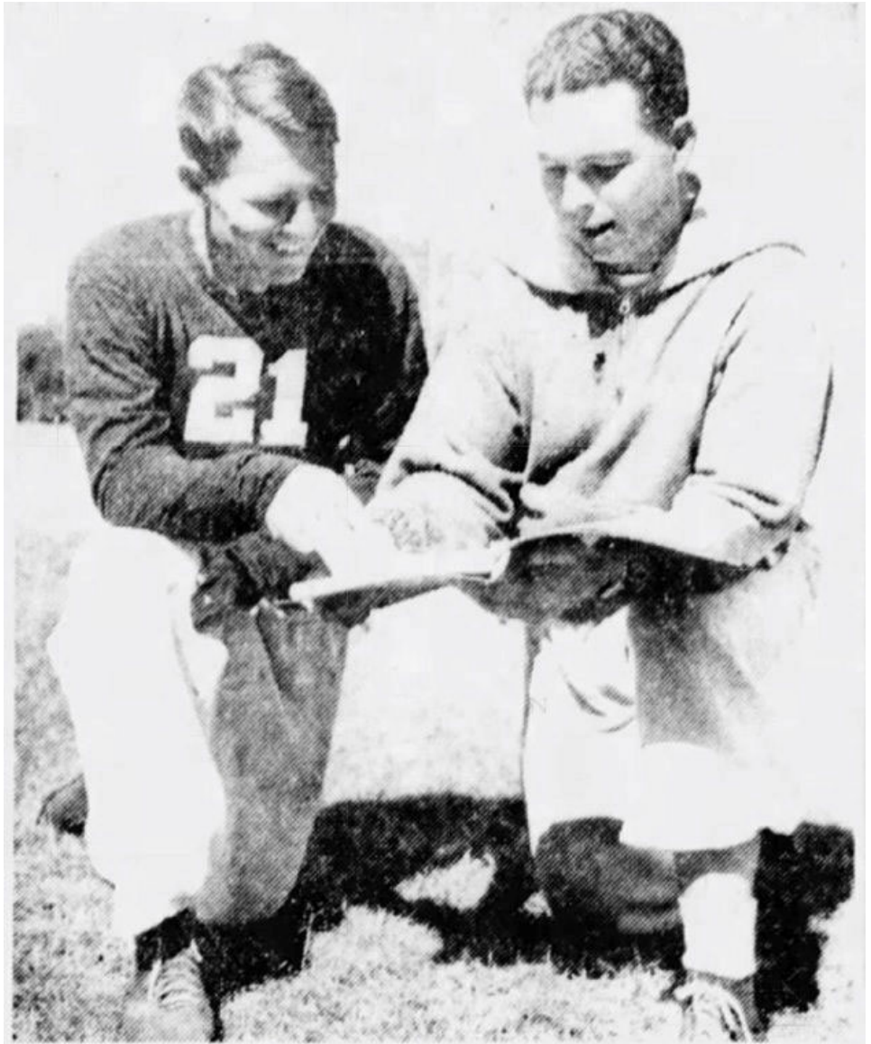
The job of molding a winning Chicago Cardinal football team this year is the lot of the two "youngish" looking men shown above. Head Coach Phil Handler, right, worked under three previous Card coaches before taking over the reins this year. His assistant, Raymond (Buddy) Parker, is starting his seventh season with the Cards and still calls the plays from his quarterback position. The Packers meet the Cardinals Sunday in Comiskey park.

SEPT 30 (Green Bay) - The Packers at Green Bay continued hard drills for their first out of town league battle of the year - against the Chicago Cardinals at Comiskey park in Chicago Sunday afternoon. The Cards have been beset with injuries and may not prove too tough to a team that held the powerful Chicago Bears to a 21 to 21 score last Sunday at the Bay. Marshall Goldberg, who has always been assigned to trailing Don Hutson, is out of the Card lineup for weeks at least, with a fractured leg, suffered in the game at Detroit. The Cards also lost guard Floyd Rhea, who has a cracked vertebrae. The Packers yesterday looked at pictures of previous Card games and then moved out on the practice field for more realistic preparation for the game. While the Cardinal fracas is the immediate objective, thoughts have already begun to turn to the second home game at Green Bay against Detroit October 10. Tickets for that game, which will mark the first appearance in these parts of