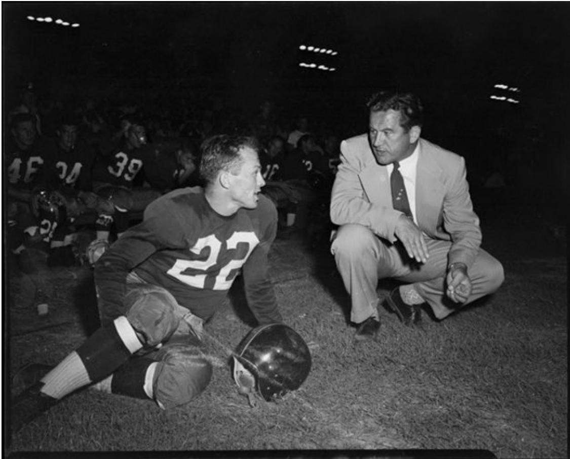
Charlie "Choo Choo" Justice on sidelines with Washington Redskins head coach Joe Kuharich during game versus the Green Bay Packers at Riddick Stadium, Raleigh, N.C., September 11, 1954.