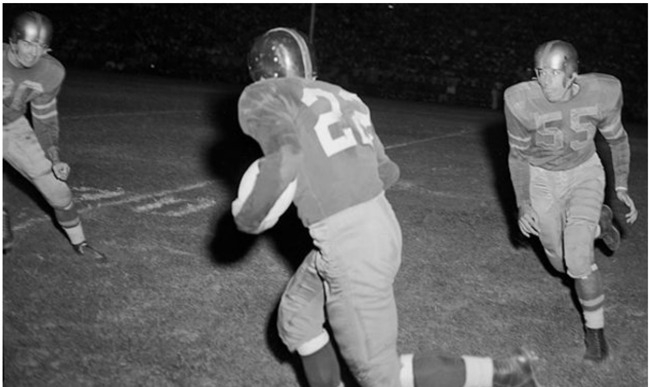
Washington Redskin running back Charlie Justice rushing along the left sideline during an exhibition game against the Green Bay Packers at Riddick Stadium, Raleigh, N.C. on September 11, 1954.