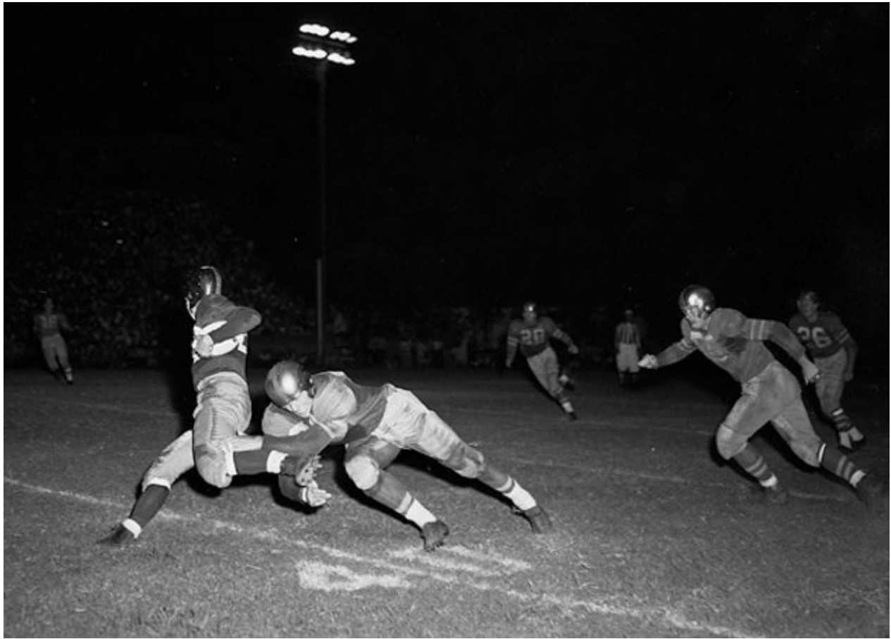
Washington Redskin running back Charlie Justice evades a tackler after catching a pass for an eleven-yard gain during an exhibition game against the Green Bay Packers at Riddick Stadium, Raleigh, N.C. on September 11, 1954.