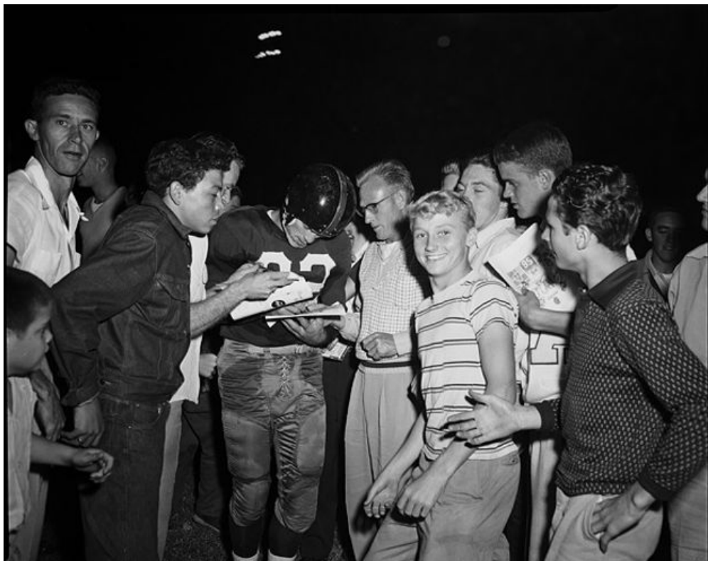
Redskins' Charlie "Choo Choo" Justice signing autographs at Washington Redskins versus Green Bay Packers football game in Riddick Stadium, Raleigh, N.C., September 11, 1954.