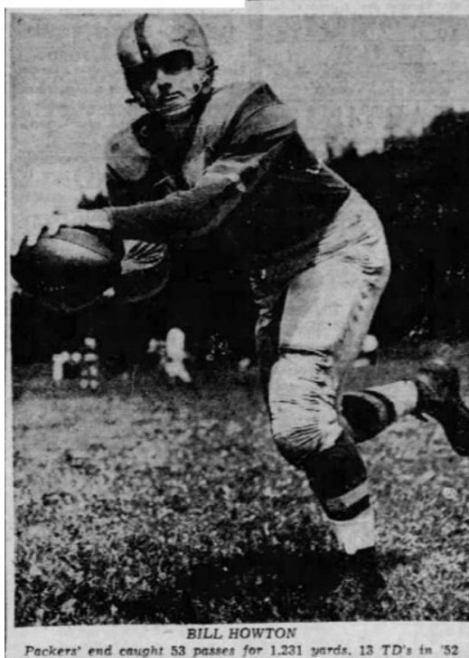
BILL HOWTON Packers' end caught 53 passes for 1,231 yards, 13 TD's in '52

PACKERS LOOK BEST IN RAIN OCT 30 (Baltimore) - Rain is a great equalizer in pro football. Last Sunday, the Cleveland Browns had their hands full in just beating the veteran New York Giants, 7 to 0. What will a muddy field do to the Colts-Packers clash here tomorrow night is purely a conjecture. But from the results of the first meeting between the two teams the Green Bay Packers would have all the best of it...ROLLED TO 302 YARDS: In that 37-to-14 victory the Packers just hammered the Chesapeake Bay entry into the ground, rolling for 303 yards. Although they passed 19 times, completing seven, the Packers just used the aerial to loosen up the Colt defense for either Babe Parilli and Tobin Rote to run the Split-T option play. On the other hand, the Colts gained only 65 yards along the ground, but added 162 by air...HUZVAR COULD PLOW: These statistics would seem to indicate a decided edge for the Packers if the Stadium turf is muddy and the ball slippery. But last Sunday the Colts found a running game of their own, and went on to defeat the Washington Redskins, 27 to 17. Big John Huzvar, the 240-