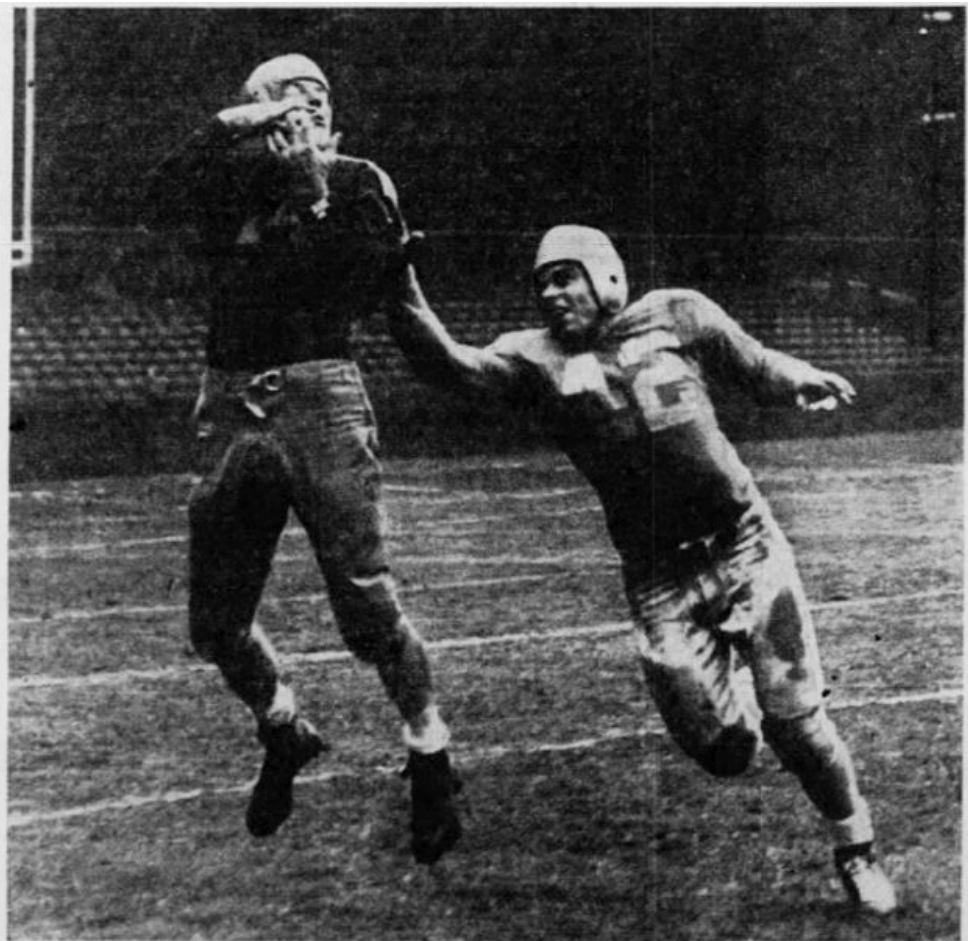
ON THE OTHER END—The difference between the Green Bay Packers and the Detroit Lions Sunday at Briggs Stadium could be totaled in the column headed Irving Comp. The Packers' pass-throwing back completed 14 throws in 18