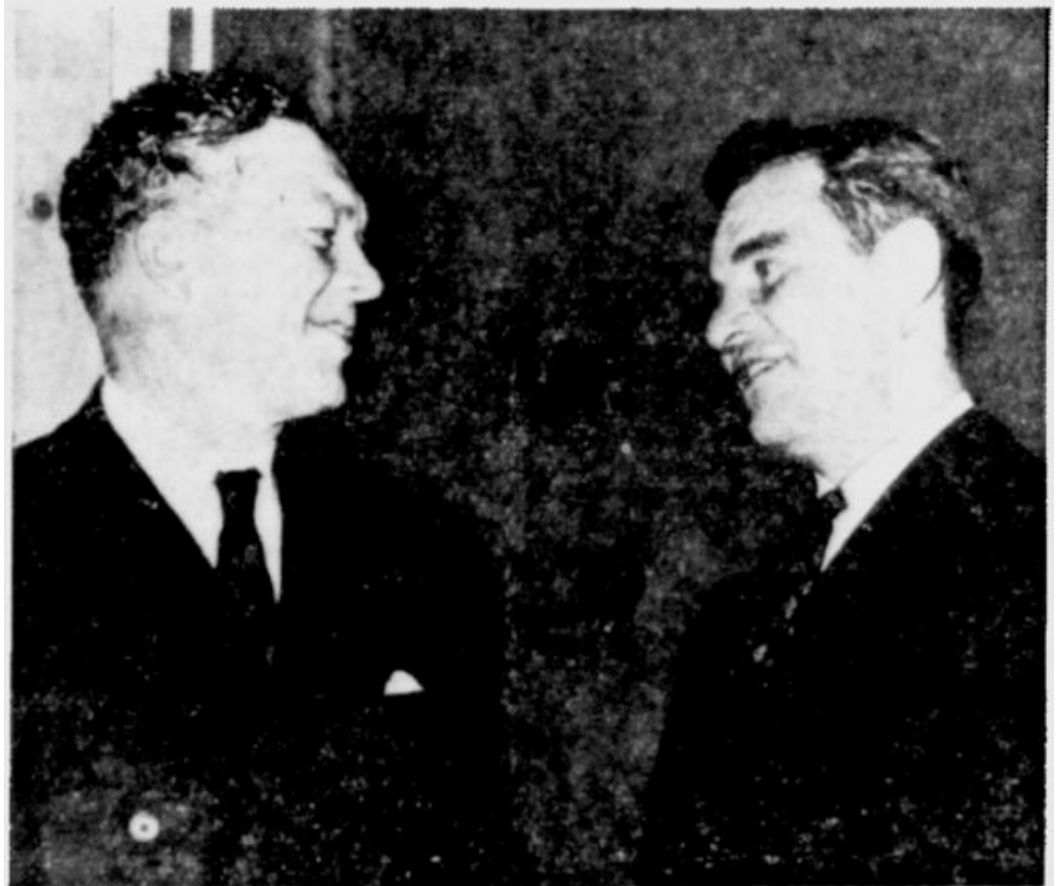
Two Wisconsin bred pro football men met at the weekly luncheon of the Football Writers' association in New York Monday. Next Sunday they will lead rival teams in the National Football league. Curly Lambeau, coach of the Green Bay Packers, is at the left; Tuffy Leemans, formerly of Superior and now backfield star and assistant coach of the New York Giants, is on the right.

OCT 29 (Milwaukee Journal) - Skipping through the pages of the New Pro Football league manual just released - and what a mine of information it is: All-Time Ball Carrying Record - Clarke Hinkle of Green Bay with 3,860 yards on 1,171 plays, an average of 3.29 yards a play. Hinkle, who is now in the coast guard, started in 1932, bowed out in 1941. Most Yards Gained in One Season - Beattie Feathers of the Bears. In 1934, one of the Bears' biggest years, Feather piled up 1,004 yards rushing despite the fact that a shoulder injury kept him out of two games. Most Yards Gained in One Game Rushing - Cliff Battles of Boston. On 16 plays in a game against the Giants, Battles gained 216 yards. Longest Run From Scrimmage in History of League - Andy Uram of Green Bay. In a game against the Cardinals at State Fair park, Uram ran 97 yards for a touchdown. Longest Punt Return - Gil Le Febvre of Cincinnati. Against Brooklyn in 1933, Le Febvre carried a punt 98 yards for a touchdown. Longest Return of an Intercepted Pass - Vern Huffman of Detroit. The old Indiana star caught a pass on the goal line and ran it back 100 yards for a touchdown against Brooklyn in 1937. Longest Run With a Fumble - George