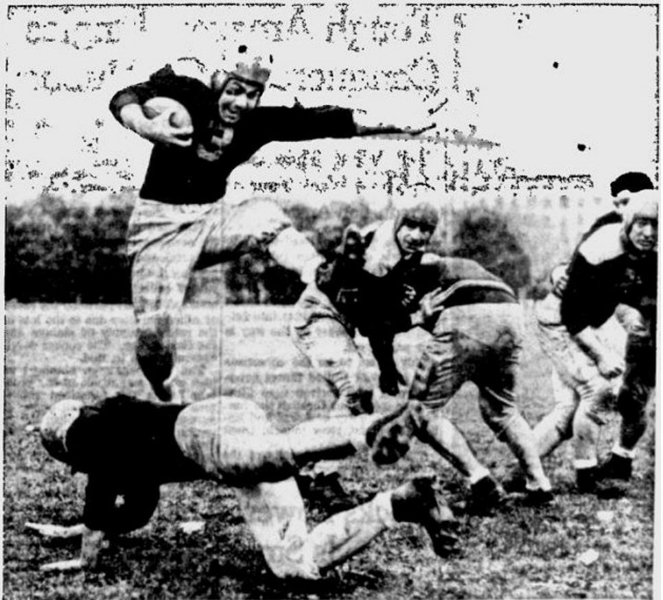
Tony Canadeo found an opening in the Green Bay Packers' defense in the team's workout Wednesday at Rye, N. Y., for Sunday's game