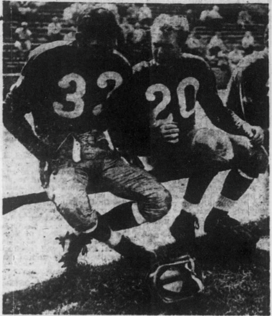
Alabama's Hurlin' Harry Gilmer gets tips from the master, Slinging Sammy Baugh. Both will be seen in action with the Washington Redskins when they meet the Green Bay Packers in Birmingham Sept. 11.