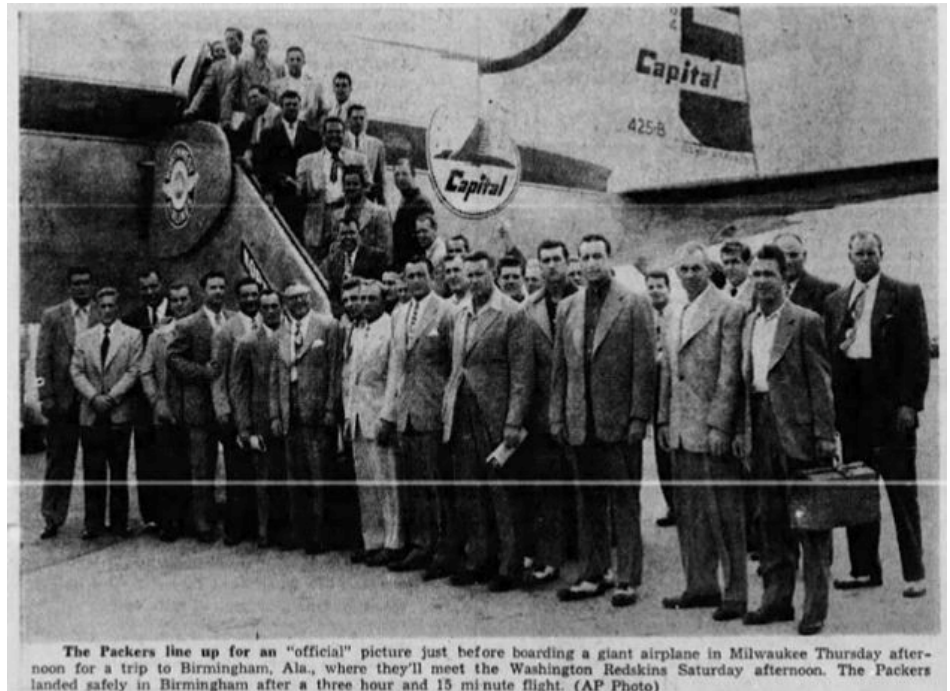
The Packers line up for an "official" picture just before boarding a giant airplane in Milwaukee Thursday afternoon for a trip to Birmingham, Ala., where they'll meet the Washington Redskins Saturday afternoon. The Packers landed safely in Birmingham after a three hour and 15 minute flight.