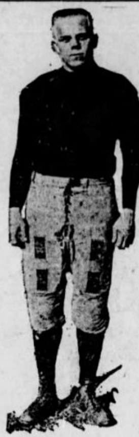
E. H. R. U. H. Right Half