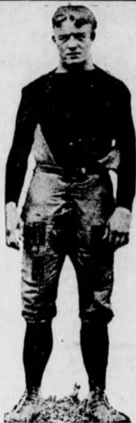
R. H. R. U. H. Left End