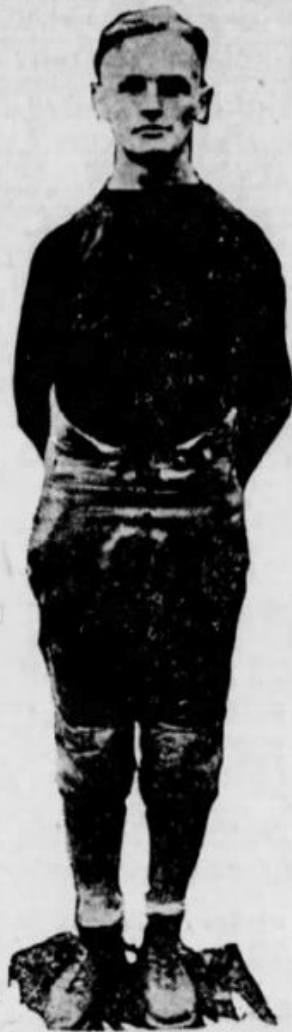
SNOOTS Left Half Back