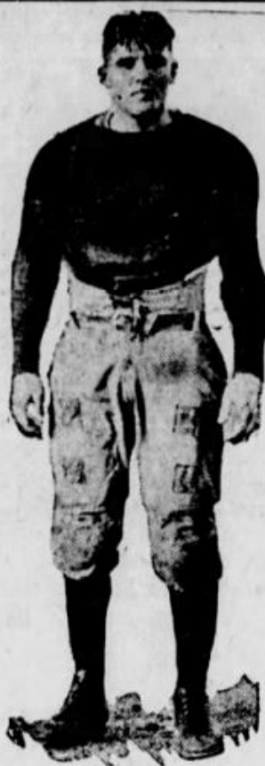
H. R. U. H. Quarterback