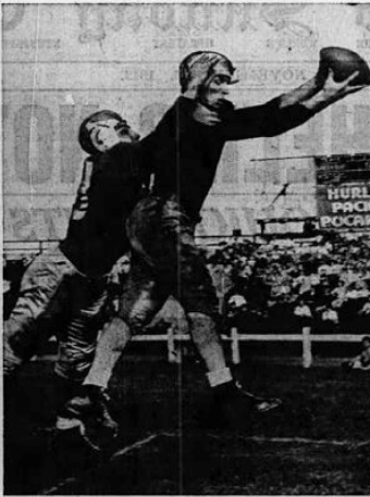
This is a little incident the Bears hope doesn't occur in Wrigley field this afternoon, where they meet Packers. Hutson takes touchdown pass on goal line against Detroit.