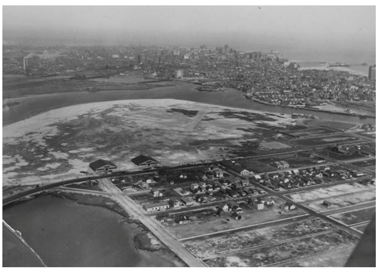
Bader Field - Atlantic City (1928)