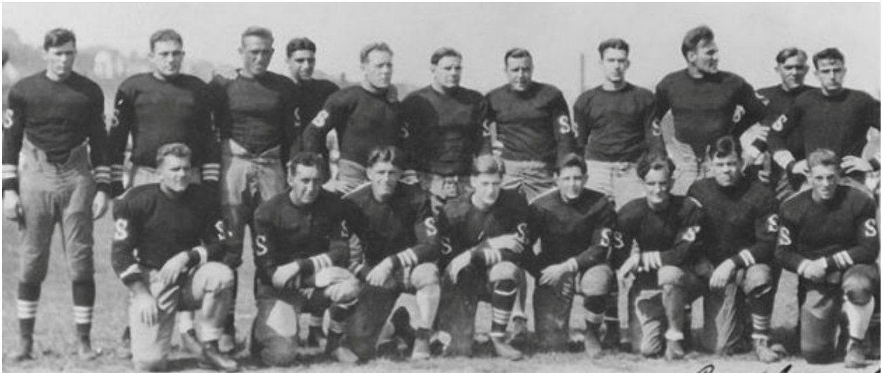
THE STATEN ISLAND STAPLETONS